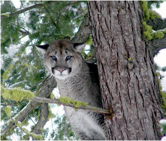
Figure 1. Adult male cougars stand about 30 inches tall at the shoulder.

“Sleek and graceful, cougars ( Puma concolor , Fig. 1) are solitary and secretive animals rarely seen even in the wild. Also known as mountain lions or pumas, cougars are known for their strength, agility, and awesome ability to jump. Their exceptionally powerful legs enable them to leap 30 feet from a standstill, or to jump 15 feet straight up a cliff wall. Cougars use their paws and claws to trip prey (i.e. a swat to the rear legs) or grab it with their claws, then use their claws to hold their prey while delivering the kill-bite. A cougar’s strength and powerful jaws allow it to take down and drag prey larger than itself.